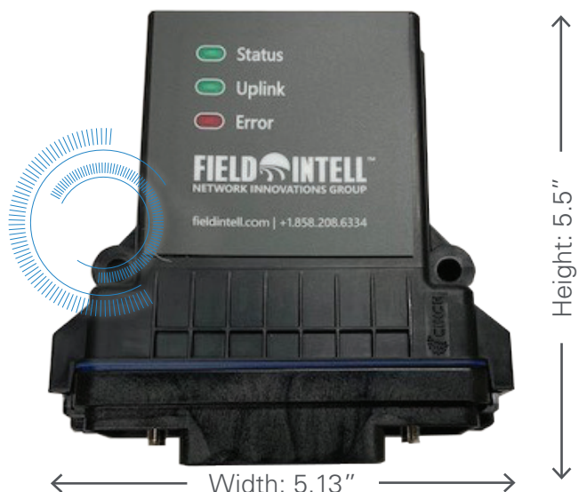
FIC-E2000 Unit - Compact Size