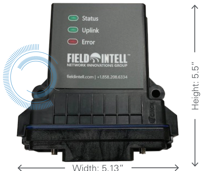
FIC-E2000 Unit - Compact Size